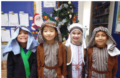
Pupils of Heather Ridge School