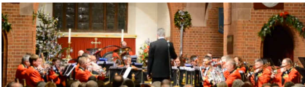
Sandhurst Silver Band

This is not an exclusive list and we would like to thank everyone who has helped raise funds for ASCT.