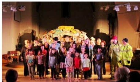
The cast of 'Throwaway Children'